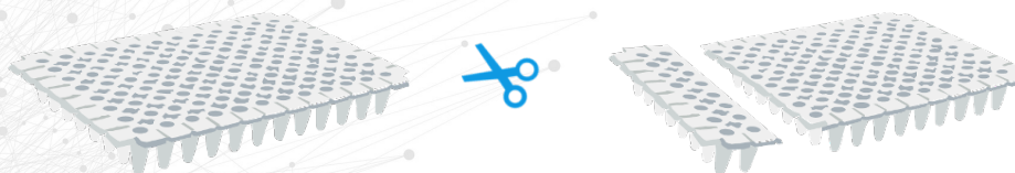
Figure 1: Example of a 96 well break-away plate before and after cutting. The cutting orientation shown may not be suitable for this specific panel. For guidance, refer to the Plate Layout section (pg. 4)

Only the included plate cap seals should be used to seal the plate for PCR amplification.