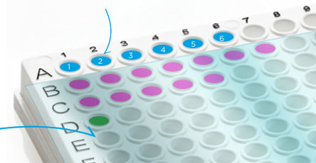
Positive control standards 1-6

Other wells sealed to avoid contamination