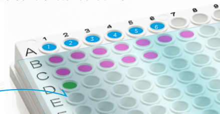
Positive control standards 1-6