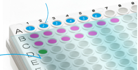
Positive control standards 1-6

Other wells sealed to avoid contamination